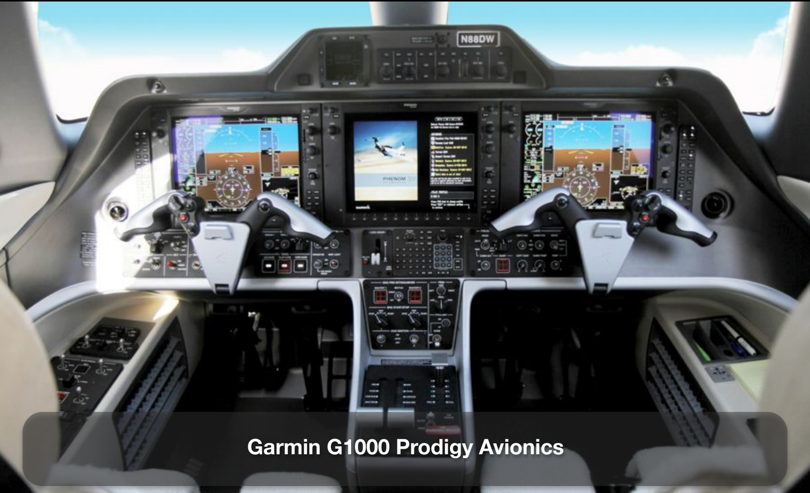
Garmin G1000 Prodigy Avionics