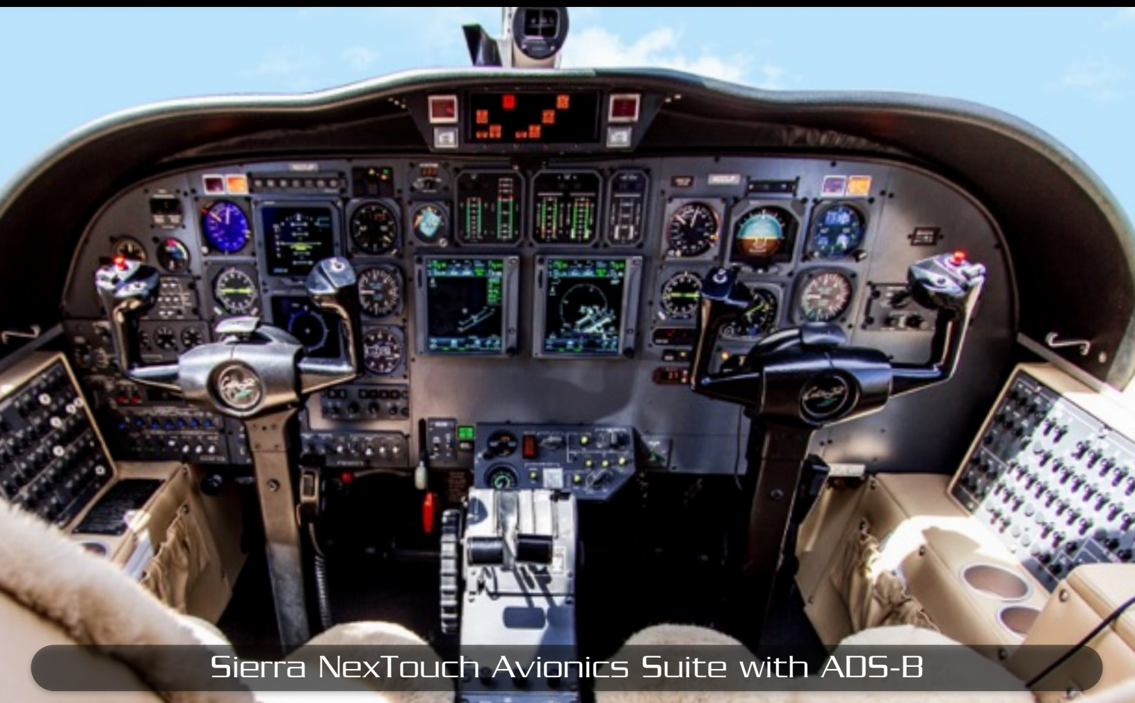
Sierra NexTouch Avionics Suite with ADS-B